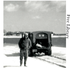
Clutching-New Suffolk Free Library

As far as we know, it hasn't happened since. We're more apt to get nor'easters than the northwest sweep in the winter/spring.